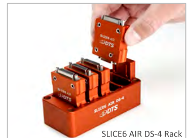
SLICE6 AIR DS-4 Rack