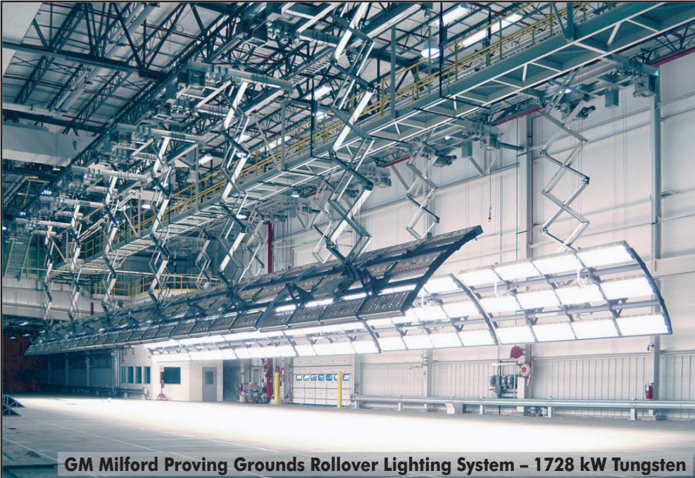
GM Milford Proving Grounds Rollover Lighting System – 1728 kW Tungsten