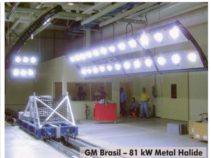
GM Brasil – 81 kW Metal Halide

Metal-Halide and Tungsten-Halogen Systems Adjustable-height & fixed systems for overhead banks, floor stands & film pits Powered elevation and tilt controlled by wireless remote tablet PC