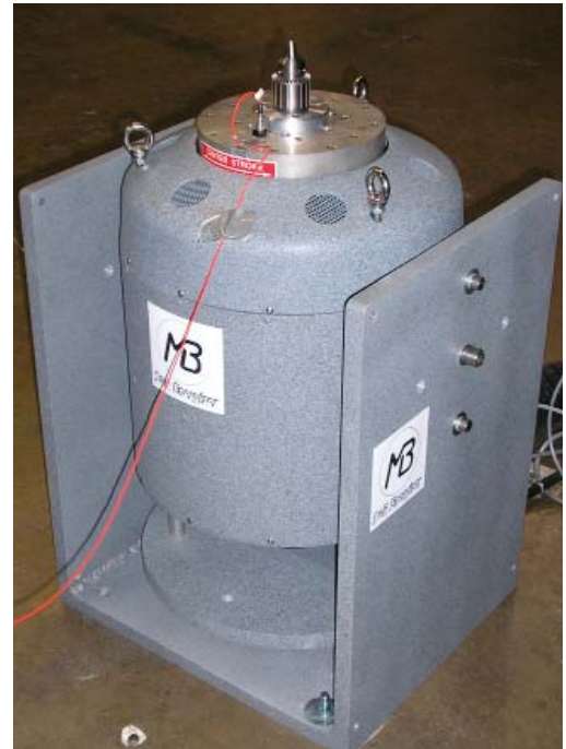
MODAL 1000 Exciter