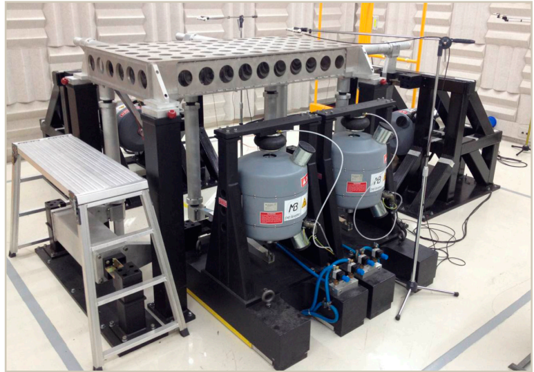
4/5 DOF BSR Energizer System installed at the Advanced Motor Parts Regional Innovation Center (AMP.RIC), Kongju National University (KNU), Korea